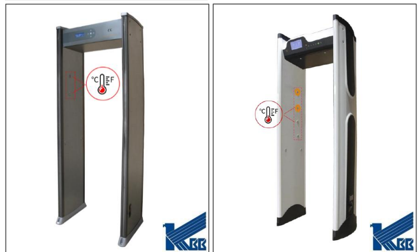
Model A: Classic